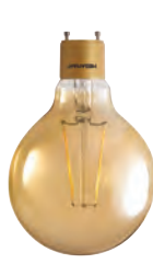
MLG322 3W LED G25 Filament Lamp GU24 Base; 3-3/4" Dia. x 5-9/16" H (LG6803DGD-GU24)