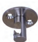
RLM80SH-(NK, AB) Swag Hook. Includes two drywall anchors and mounting screws. Shown in Brushed Nickel. 1-1/2" Dia. x 1-1/8" H