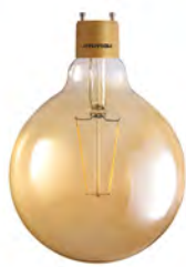
MLG222 3W LED G40 Filament Lamp GU24 Base; 4-7/8" Dia. x 7" H (LG6903DGD-GU24)