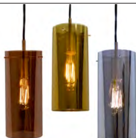
CTG61-(C, G, S) Element Metallic Glass Cylinder Shades. Available in Copper, Gold, and Silver/Chrome. 4-3/4" Dia. x 10-5/8" H