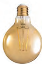
MLE322 3W LED G25 Filament Lamp E26 Base; 3-3/4" Dia. x 5-5/16" H (LG6803DGD-E26)