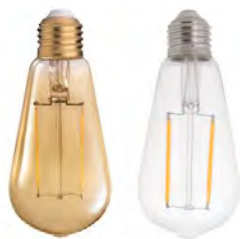
MLE122/MLE127 3W LED ST19 Filament Lamp E26 Base; 2-3/8" Dia. x 5-1/4" H (LG7003DGD-E26/LG7003DCS-E26)