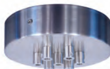
RLM80C7-NK Seven (7) Port Round Canopy. Shown in Brushed Nickel.