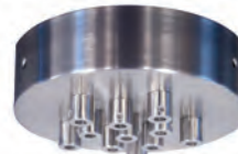
RLM80C11-NK Eleven (11) Port Round Canopy. Shown in Brushed Nickel.