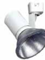
CTL1638 Shown with Short Neck PAR30 Lamp