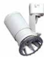
CTL1638 Shown with PAR20 Lamp