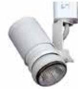
CTL1638 Shown with PAR16 Lamp

Standard ConTech track fixtures are cCSAus Certified as-is for use with ConTech's many track systems, as well as with Juno ®1 Lighting track. By changing the prefix in the part number, ConTech can install inserts which make our fixtures compatible with other manufacturers. Replace "CTL" with "HTL" for Halo ®2 track, and "LTL" for Lightolier ®3 track. For more information, please consult our factory.