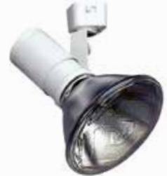
CTL1638 Shown with PAR38 Lamp