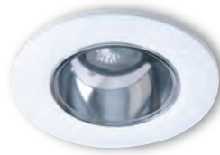
CTR1614-P-CLR White Angled Wall Wash

CTR1603-P - White Slotted Wall Wash, Black Interior