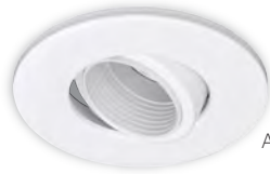
CTR1607-P-WHT Adjustable White Pin Spot White Baffle & Trim