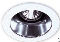
CTR1602-P-CLR Adjustable Multiplier: Clear Reflector, White Trim