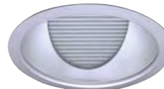
CN4323-PL Platinum Reflector

4-3/8-Inch ID; 4-3/4-Inch OD. 4-3/8-Inch H Specification Grade Specular Reflector. Trim cannot be used on Remodel Housings (R4RM) or with Slope Ceiling Adapters (RSA4L). For use with 1/2- to 1-inch ceiling thicknesses only. For Wet Location approved trim, add "-C" for Clear Lens or "-SL" for Sandblast Lens after finish code.