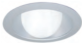
C4323-CLR Clear Reflector

C4323 Series Lensed Wall Wash Reflector Trim 4-Inch ID; 5-11/16-Inch OD