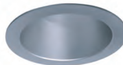
C4322DF-SL Satin Silver Painted Reflector

Specification Grade Reflector. For Wet Location approved trim, add “-C” for Clear Lens or “-SL” for Sandblast Lens after finish code.