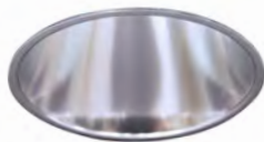
CN4322 *-CLR Specular Clear Reflector Multiple Beam Spreads

Trimless Options require use of Mud Frame accessory (MF4, ordered separately)