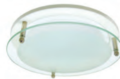
CTR4325L-WHT-P Floating Glass Disc White Reflector

C4323 Series Lensed Wall Wash Reflector Trim 4-Inch ID; 5-11/16-Inch OD