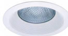
C4327-CLR-P Clear Reflector/White Lower Baffle/ Regressed Prismatic Convex Lens

Two Piece Reflector with Lens: Upper Reflector with Lower Cone and Prismatic Convex Lens. Lens has 1-1/2-inch regress. Wet Location Listed.