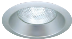
C4327-CLR-PL Clear Reflector/Platinum Lower Cone/ Regressed Prismatic Convex Lens