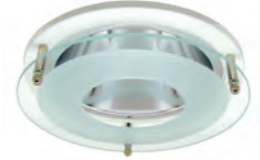
CTR4326L-CLR-P Floating Glass Ring Clear Reflector