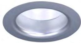
C4321-WHT-PL White Reflector/Platinum Lower Cone