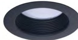
C4321-WHT-B White Reflector/Black Baffle

Two Piece Reflector: Upper Reflector with Lower Cone. Includes one (1) LF20-CL Clear Glass Lens. Approved for Wet Locations when Glass Lens is installed.