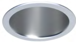
C4322-PL Platinum Reflector