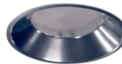
CN4322S-CLR Anodized Clear Trimless Reflector

Required for use with trimless options. Die-cast Ring with Steel Mesh Frame. Painted white.