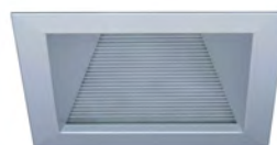
C4323SQDC-SL Satin Silver Painted Wall Wash

Angled Diffuse Glass Spread Lens. Wet Location approved.