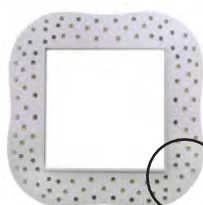
MF4SQ Square Mud Frame

Trimless Options require use of Mud Frame accessory (MF4SQ, ordered separately)